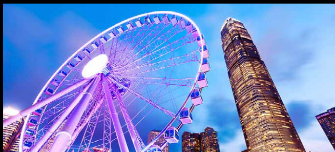
Hong Kong Observation Wheel