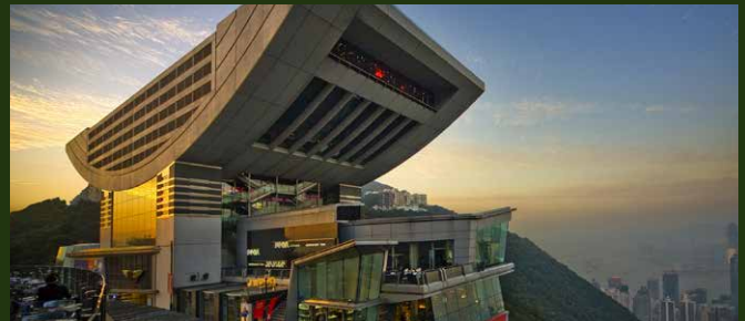
The Sky Terrace 428