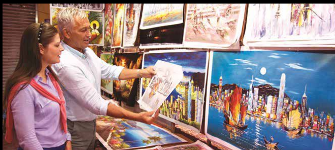
Temple Street Night Market