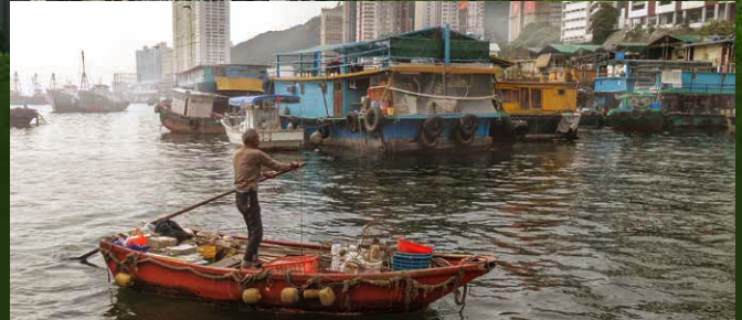
Aberdeen Fishing Village