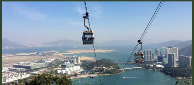
Ngong Ping Cable Car