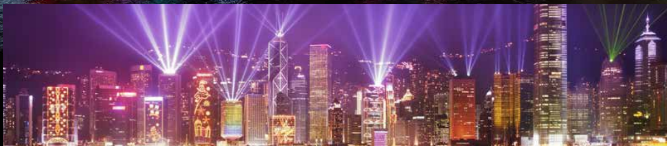
A Symphony of Lights