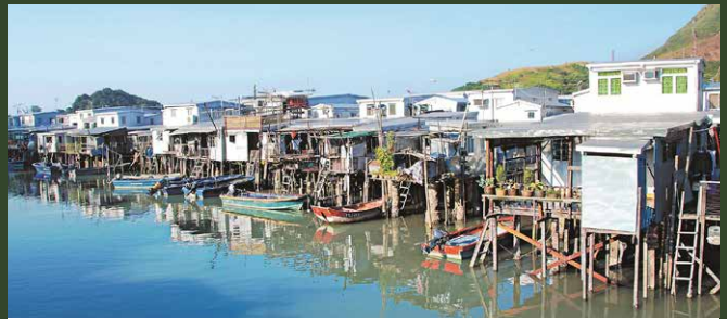
Tai O Fishing Village